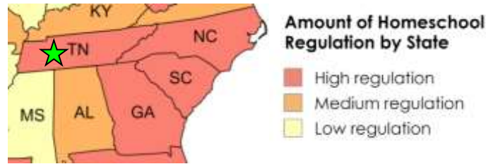
Tennessee and some bordering states; Alabama, Georgia, Kentucky, Mississippi, North Carolina, and South Carolina (JHU Homeschool Hub, 2025).

Compared to nearby states like Georgia, North Carolina, and South Carolina, Tennessee’s regulatory policies are generally aligned with those of its neighbors. Each of these states is a high-regulation state, meaning that it has extensive rules and regulations for families registering for and maintaining homeschooling. For example, each of these states requires families to send notice to their local district, alerting them to a child’s participation in a home education program.